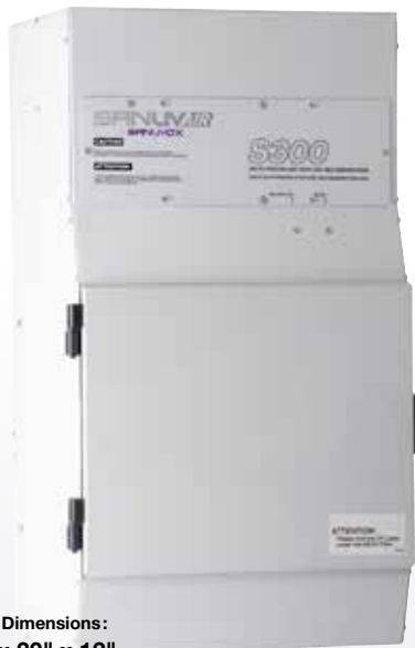
Unit Dimensions: 17" x 30" x 12"